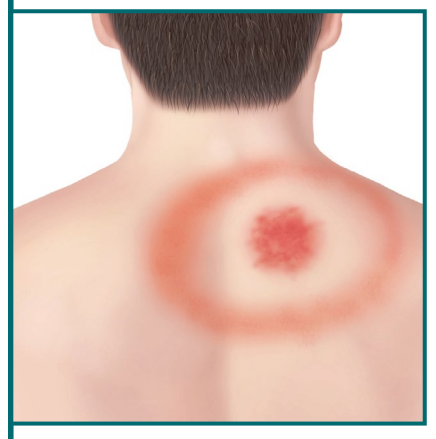
Bull's eye rash on the back.